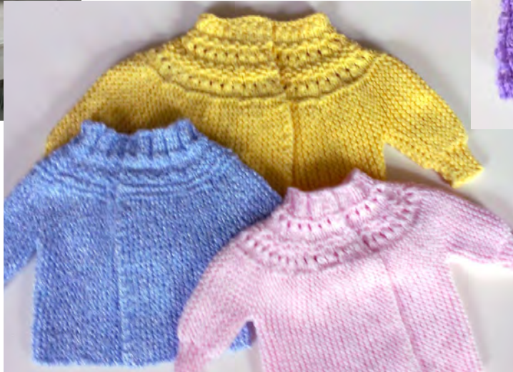
Gail Lamont knit these yoked sweaters