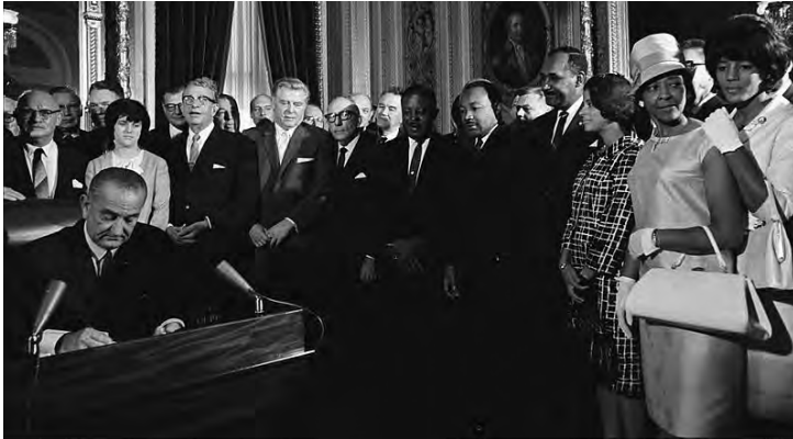
President Lyndon B. Johnson signs the Voting Rights Act of 1965 while Martin Luther King and others look on

The ELCA Churchwide Assembly, in Pittsburgh, Pennsylvania, passed a resolution calling for voting rights for all citizens to be guaranteed. The resolution was submitted by Kwame Pitts, Metropolitan Chicago Synod. The resolution passed 811-39.